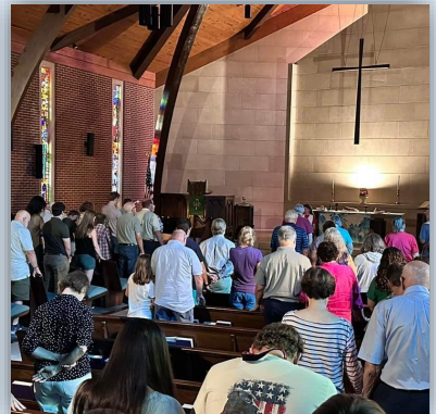
Communion Worship Service October 6, 2024