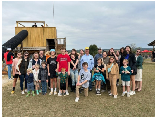
Children & Youth Fellowship Event October 27, 2024 Steed's Dairy

After that, we'll hang out in the youth room for more snacks and a viewing of A Charlie Brown Thanksgiving . We can't wait to see you there!