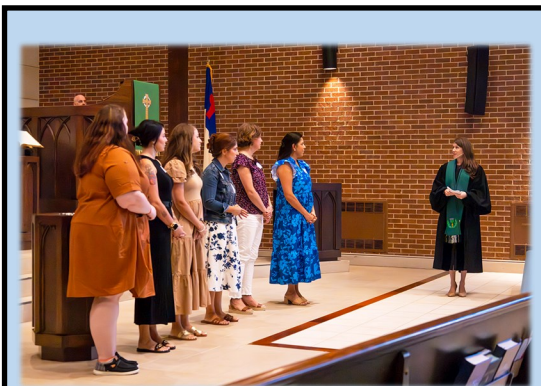
Preschool Sunday & Commissioning Preschool Staff August 11, 2024