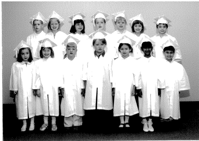
Kindergarten Class of 2008