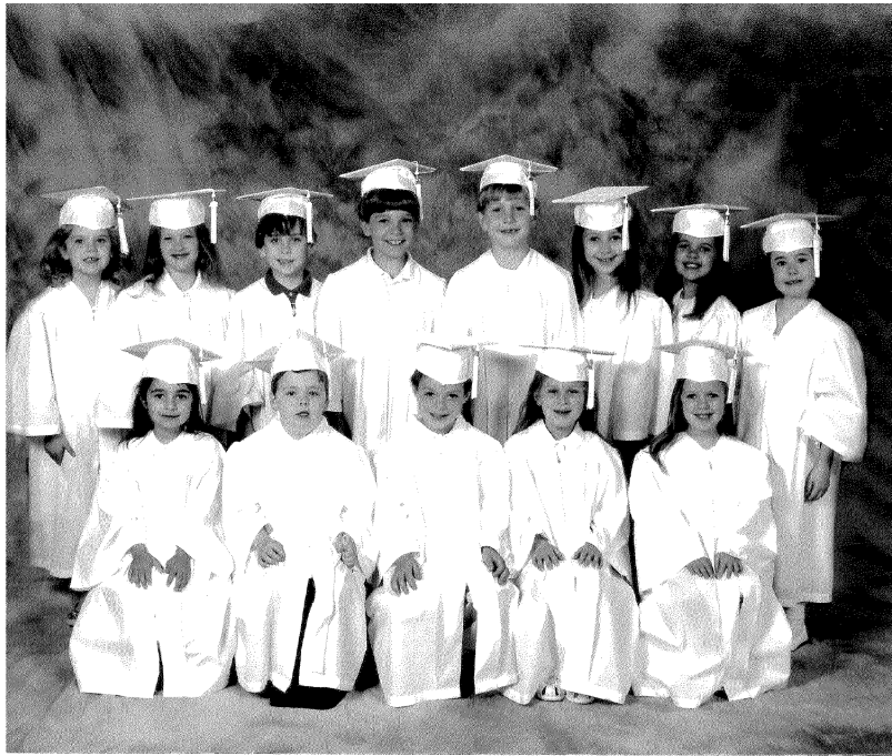
Kindergarten Class of 2011